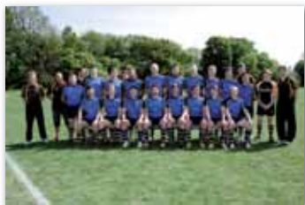
Hertford RFC winning Presidents' Cup

Although 5 Clubs were eligible for this season's Presidents' Cup only Hertford, Tring and Old Albanian entered with Hertford running out winners in the Final against Tring on a hot, sunny afternoon at Harpenden RFC.